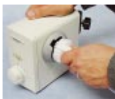
1 Align tab on cassette to slot on cassette collar.