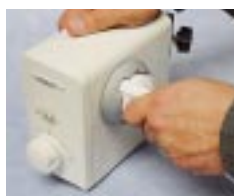
2 Press cassette into collar.