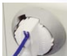
3 Push/twist clockwise.

Trumpet valve, tubing and probe are lightweight for simple, less costly disposal.