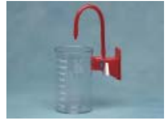
Canister with Built-in On/Off Valve 65652-611, 65652-616, 65652-631