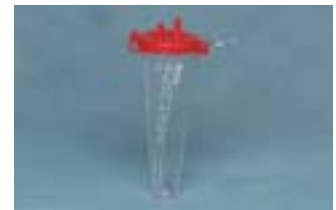
Universal Critical Measure 65651-700