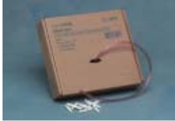
Bulk Connecting Tubing

Flexible, connecting tubing to adapt system for various setups.