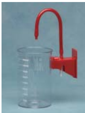
Canister for Wall Mount