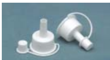
Pour/Accessory Port Converter/Large

Used to convert the pour/accessory port into an additional patient port. Accepts up to \frac{3}{8} " I.D. tubing with male port.