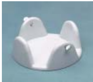
Single-Canister Base Stand