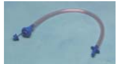
Tandem Tube 65652-620