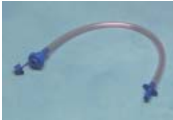
Flex Advantage® Tandem Tube

Used to connect vacuum source to canisters and manifolds. 8mm I.D. 100' roll per box; 4 boxes per case.