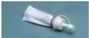
Short Specimen Sock

Used to convert pour/accessory port into a male port specimen retainer. Accepts up to \frac{3}{8} " I.D. tubing with male port. Length 9".