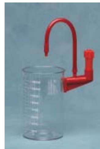
Canister with D.I.S.S.