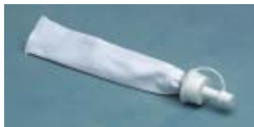
Standard Specimen Sock

Used to collect and retain specimens for analysis. 10 per case.