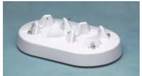
Double-Canister Roll Stand