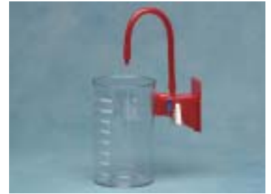
Canister with Built-in On/Off Valve 65652-611 1000cc 65652-616 1500cc 65652-631 3000cc