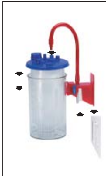
Wall Mount Single-Canister Assembly