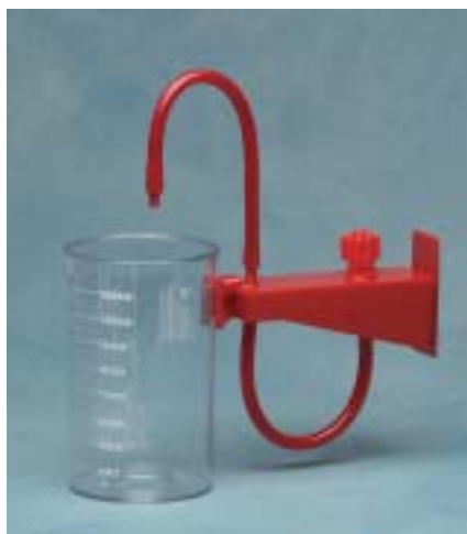
Canister with Extended Bracket for Regulator