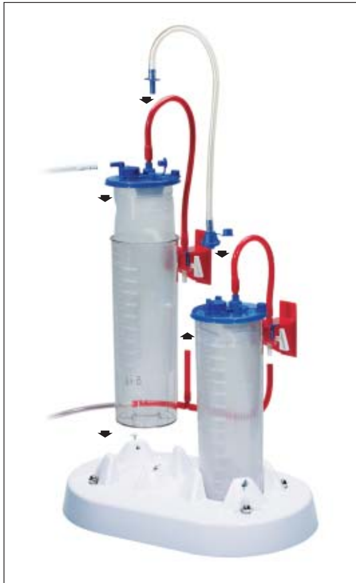
Two-Canister Floor Stand Assembly

This is a two-canister floor stand installation. The stand is mounted on casters for ease of movement.