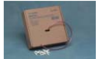
Bulk Tubing 516500