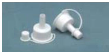
Pour/Accessory Port Converter

Used to convert the pour/accessory port into a female port specimen retainer which will accept tubing sets with preattached hard plastic (or metal) male end fittings. Length 9".