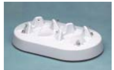
Double-Canister Roll Stand 65652-928