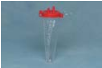
Universal Critical Measure