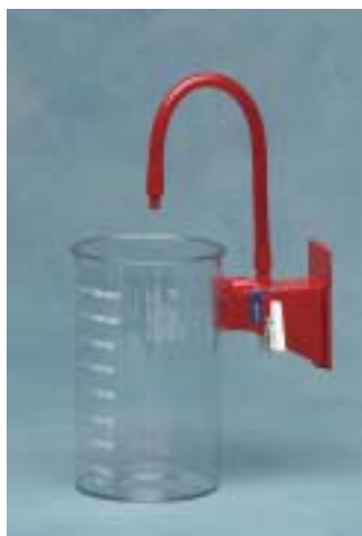
Canister with Built-In On/Off Valve

Reusable outer canister used to hold disposable flexible liner.