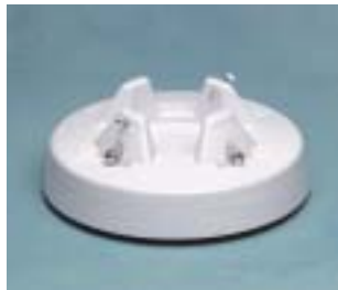
Single-Canister Roll Stand