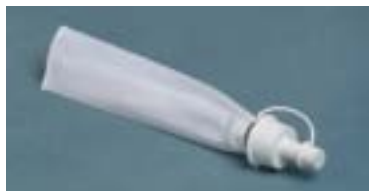
Large-Port Specimen Sock

Used to convert pour/accessory port into a male port specimen retainer. Accepts up to \frac{3}{8} " I.D. tubing with male port. Length 4 \frac{1}{2} ".