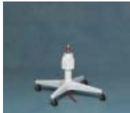
Short with Regulator Mount