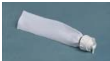
Female Specimen Sock

Used to convert pour/accessory port into a male port specimen retainer. Accepts \frac{3}{8} " to \frac{1}{2} " I.D. tubing with male port. Length 9".