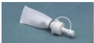
Short Specimen Sock Without Stick

Used to convert pour/accessory port into a male port specimen retainer. Accepts up to \frac{3}{8} " I.D. tubing with male port. Length 4 \frac{1}{2} ".