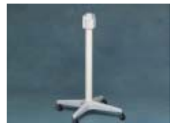
Roll Stand, Tall 65652-586