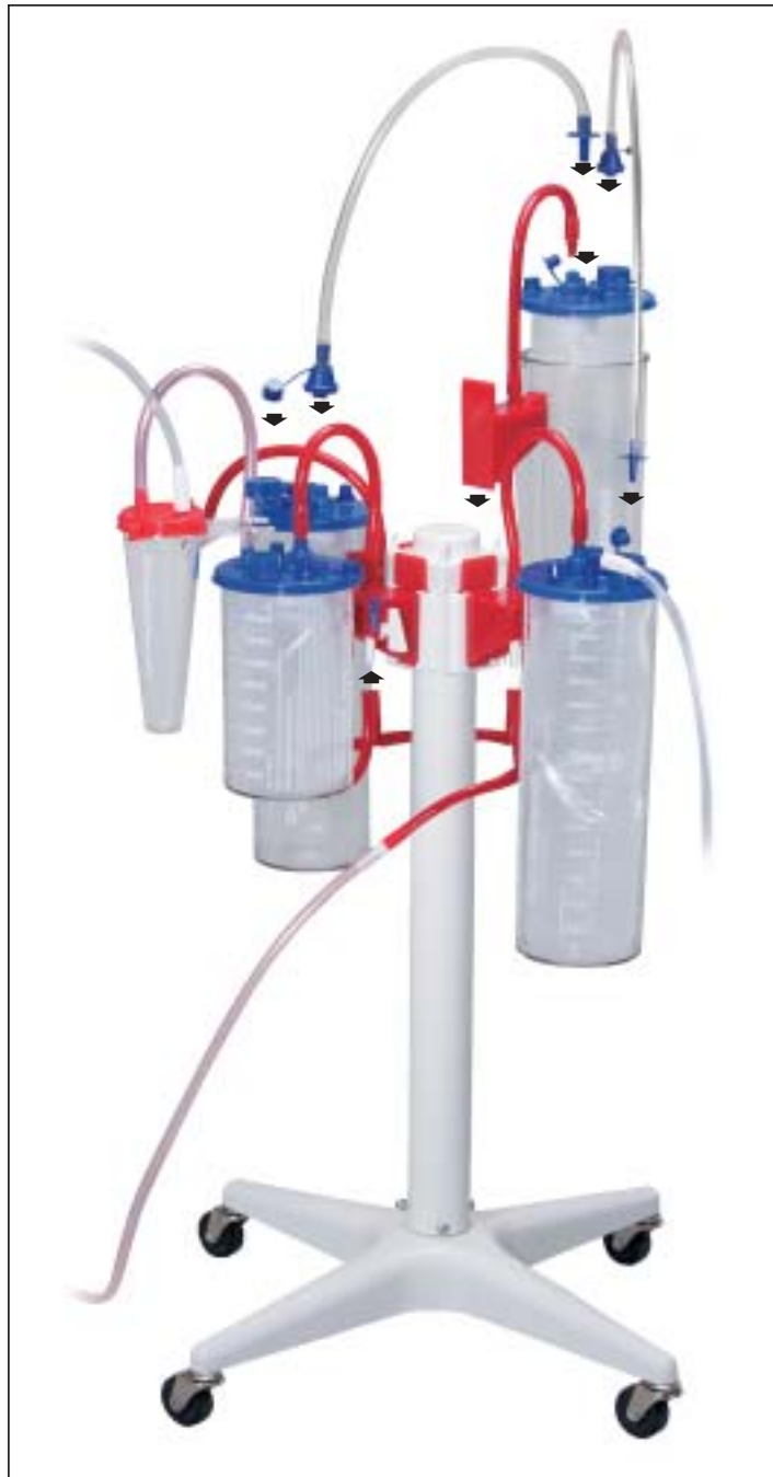
Multiple Flex Advantage Canister Assembly

This is a multiple canister tandem setup to be used when fluid collection of greater than one canister capacity is anticipated. Other configurations are available to meet your specific suctioning requirements.