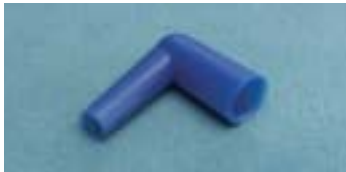
Right-Angle Adapter for Flex Advantage Port and CRD and Guardian Ortho Ports