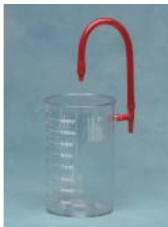
Canister with Tee Connection