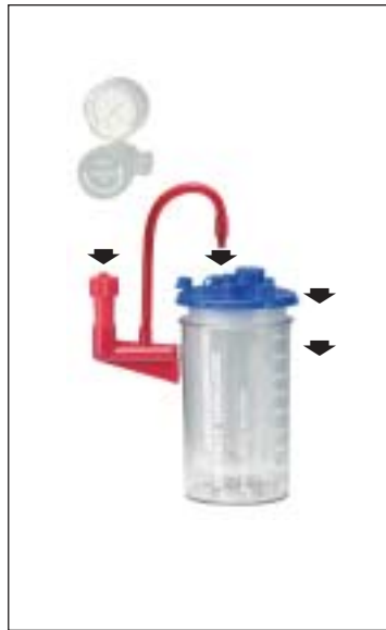
Direct to Regulator Assembly

The Flex Advantage® system is available in several assembly options, allowing for flexibility at the point of use.