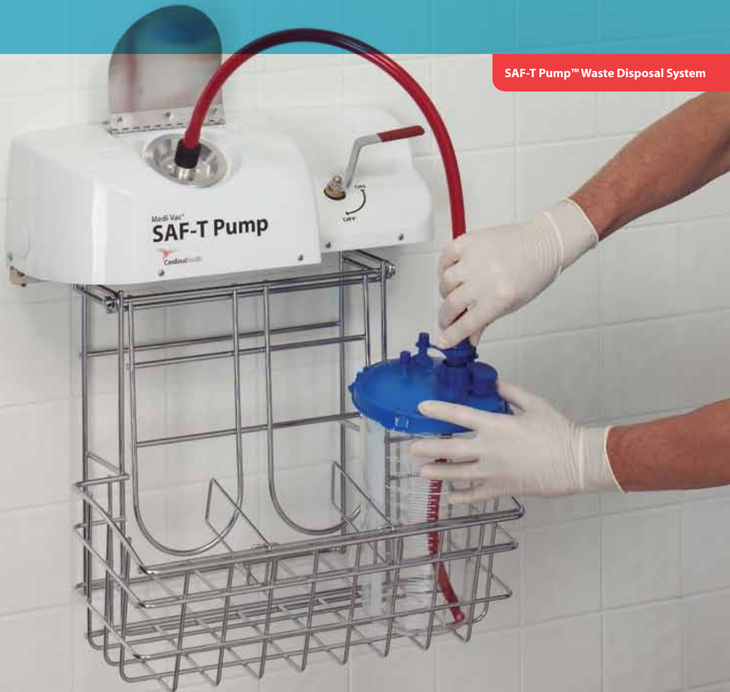
SAF-T Pump™ Waste Disposal System