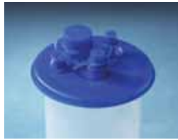
Flex Advantage® Canister