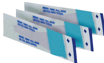
Digital thermometer probe covers