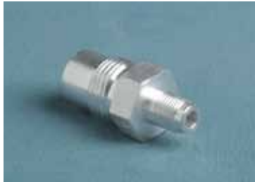
Male D.I.S.S. (metal)

Allow use with standard vacuum regulator Diameter Index Safety System (D.I.S.S.) connections.