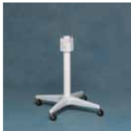
20 in. Roll stand