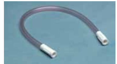
Tandem tube 65652-542A