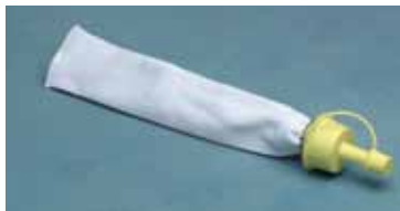
Female specimen sock