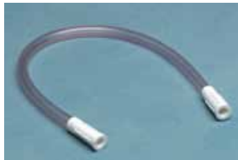
CRD™ and Guardian™ tandem tube