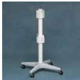
30 in. Eight-canister dual-head roll stand