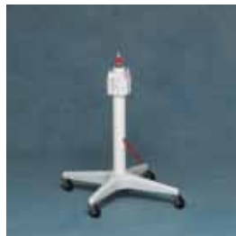
20 in. Roll stand with regulator mount