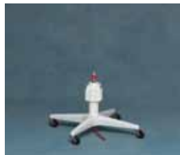
11 in. Roll stand with regulator mount