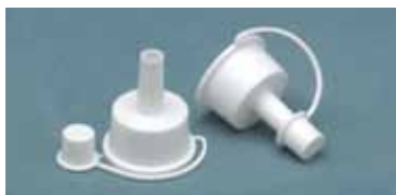
Accessory port convertor

Used to convert the accessory port into an additional patient port.