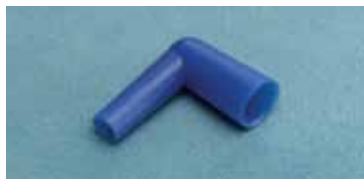
Right-angle adapter for Flex Advantage® port and CRD™ and Guardian™ ortho ports