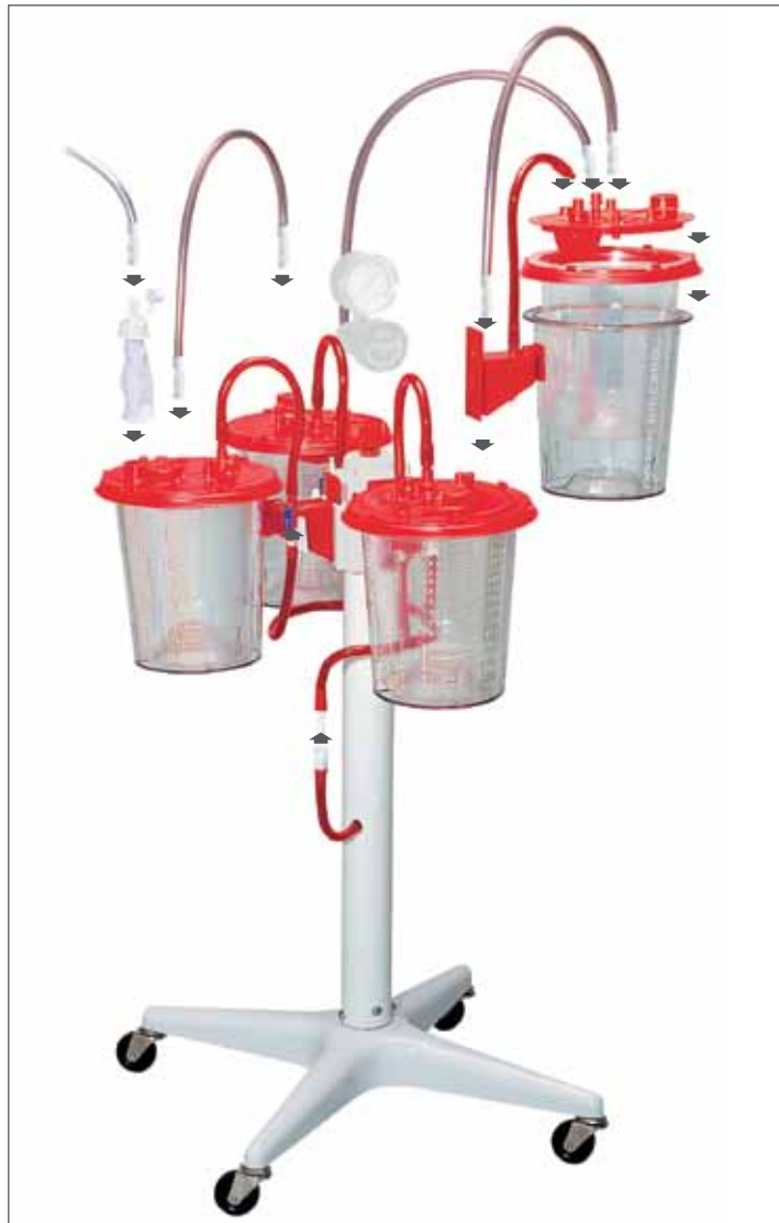
Multiple CRD™ canister tandem assembly

This is a four-canister tandem setup to be used when fluid collection of as much as 12,000cc is anticipated. Other configurations are available to meet your specific suctioning requirements.