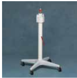
30 in. Roll stand with regulator mount