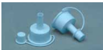
Accessory port convertor/large