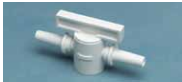
In-line vacuum on/off valve