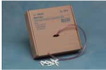
Bulk connecting tubing

Flexible, connecting tubing to adapt your system for various setups.