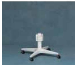
11 in. Roll stand