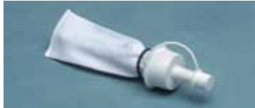
Short specimen sock