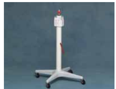
30 In. Roll stand with regulator mount 65652-596