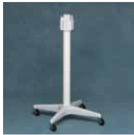
30 in. Roll stand

Roll stands allow flexibility in the location and configuration of Medi-Vac® canister (CRD™, Flex Advantage® or Guardian™ systems) installations.