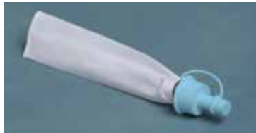
Large-port specimen sock