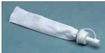
Standard specimen sock

Used to collect and retain specimens for analysis.