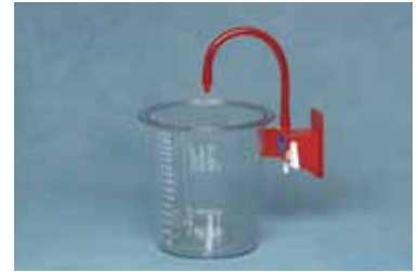
Canister with built-in on/off valve 65652-511 1000cc 65652-516 1500cc 65652-531 3000cc