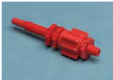
Universal female D.I.S.S.