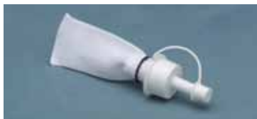
Short specimen sock without stick