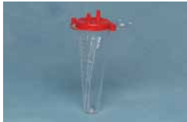
Universal critical measure