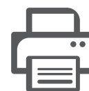
Copiers, printers, paper