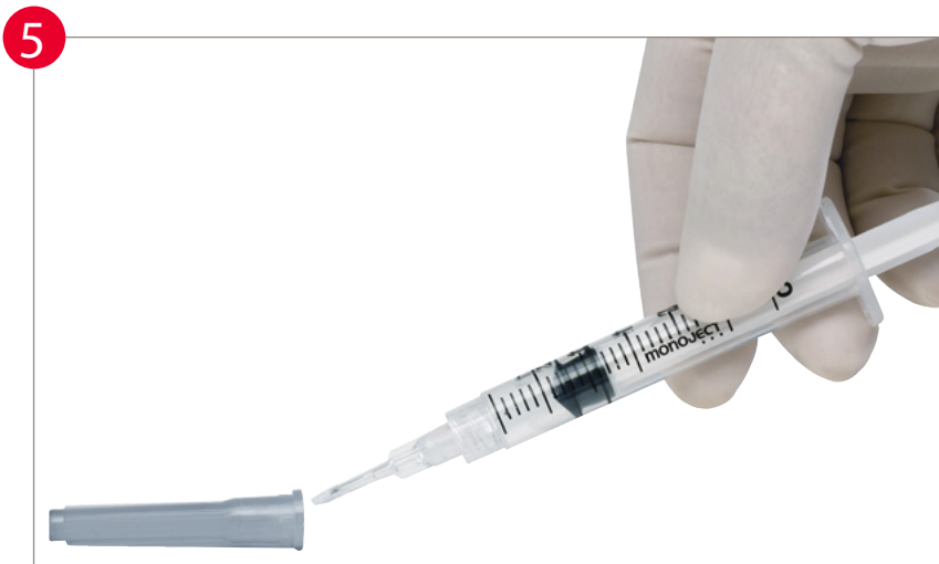
5 Re-sheath Monoject™ SmarTip™ cannula using a one-handed OSHA approved scoop and hold technique.