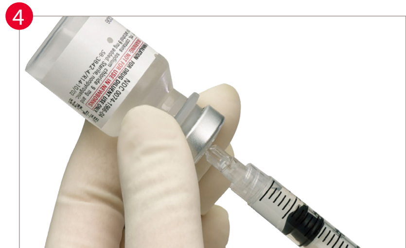
4 Draw medication per facility protocol. If pressurizing vial, use air equal to amount of medication to be drawn to avoid over-pressurizing vial and expulsion of excess fluid.