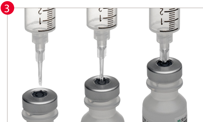
3 Penetrate vial with Monoject™ SmarTip™ cannula. For best results place vial on counter. DO NOT angle cannula during insertion; hold perpendicular to vial. Use quick, consistent force to penetrate center of vial.