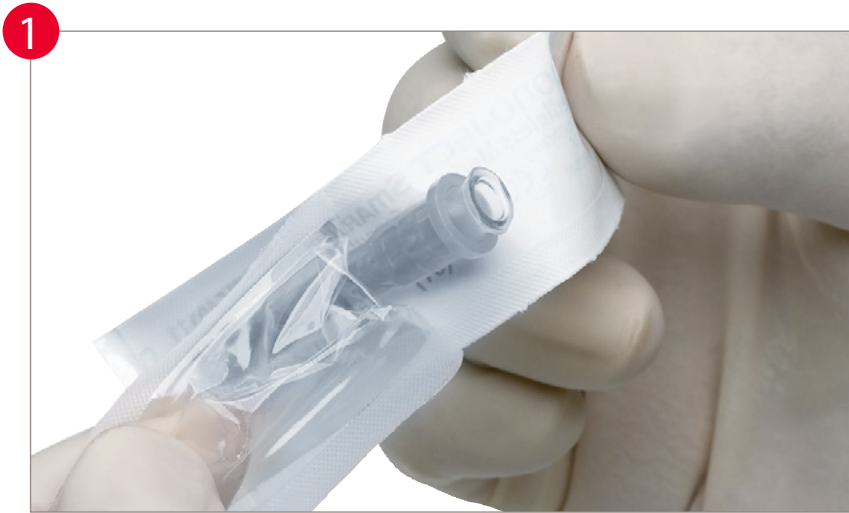
1 Remove Monoject™ SmarTip™ cannula from packaging. Use aseptic technique.