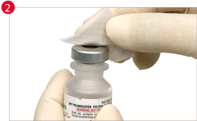
2 Clean medication vial per facility protocol.