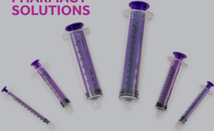
Monoject™ Purple Oral Syringe Family