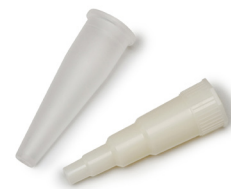
Kangaroo™ Dust Cover

For more information, please contact your local Medtronic representative.