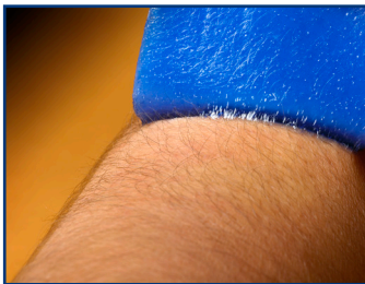
The PolyHesive® Blue Gel Electrodes remove cleanly, painlessly and easily.

Uni-Patch™ stimulating electrodes with proprietary PolyHesive® conductive blue gel are designed especially for patients with skin sensitivities. PolyHesive® bonds seamlessly to the skin and conforms to even minor irregularities.