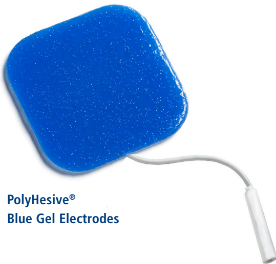
PolyHesive® Blue Gel Electrodes